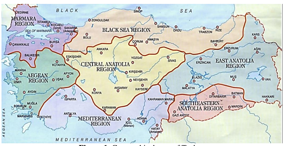
Figure 1. Geographical map of Turkey

Participants are grouped based on their native provinces data by the seven geographical regions of Turkey (Figure 1).