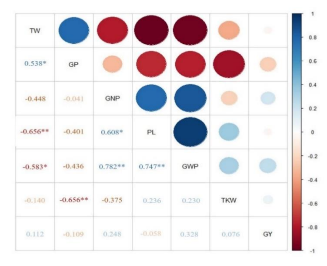
Figure 2. Correlation relationship for the examined features